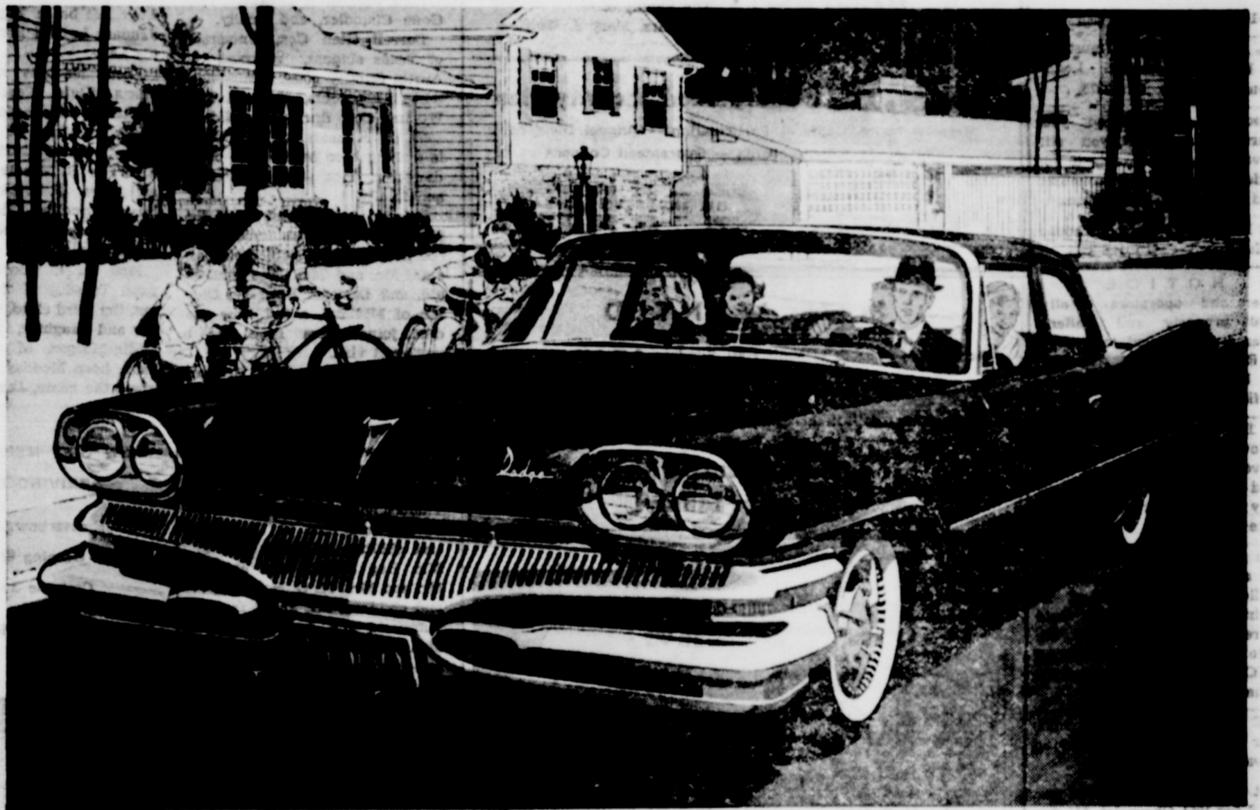
Thrifty Seneca sedan—one of a complete new line of economy cars in the low-price field.

Never before such a car priced with the lowest!