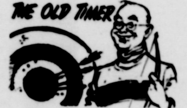
"No wonder it's hard to save money. The neighbors are always buying things we can't afford."