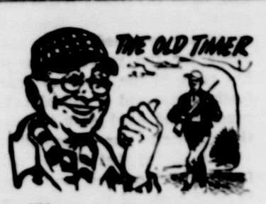
Never invite trouble because it will always accept!"