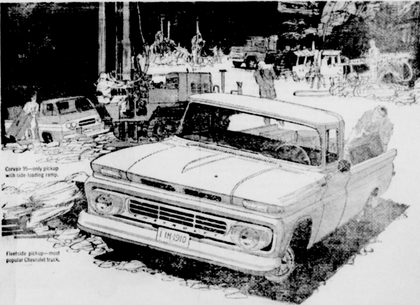
Corvair 95—only pickup with side-loading ramp.