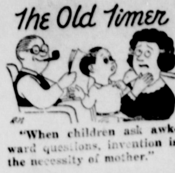
"When children ask awkward questions, invention is the necessity of mother."

The Rummage Sale by the American Legion Auxiliary will close on Saturday, Nov. 3. Lots of merchandise, including many new items, available now