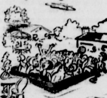
"She's the hostess with the mostest."

PROTECTED AGAINST LOSSES ON YOUR LIVESTOCK? Don't let your profits "die" on you!