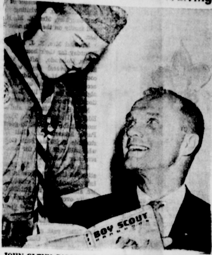
JOHN GLENN CALLS BOY SCOUTING "FUN" —Reviewing the Boy Scout Handbook, Astronaut John Glenn tells a Boy Scout, "You'll find that Scouting gives you a chance to learn and do many exciting things. Scouting is fun." The Boy Scouts of America is now conducting its "Go" roundup for new members.