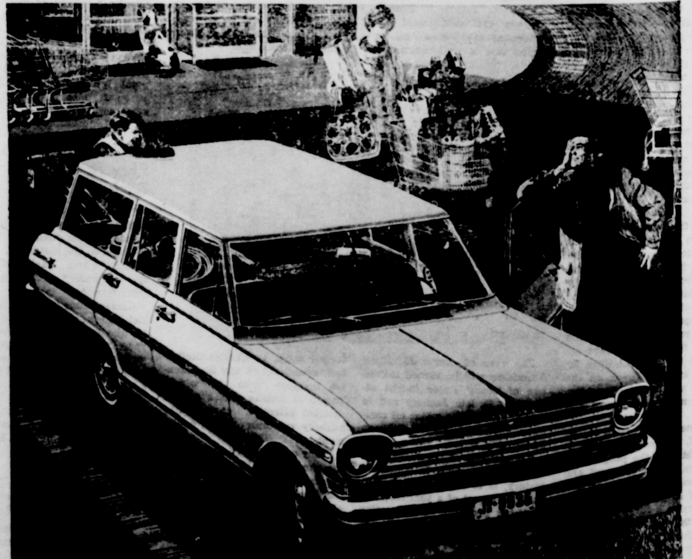
Note 400 4-Door 6-Passenger Station Wagon

this one goes and goes on a gallon. They grow with brakes that adjust themselves. An exhaust system that lasts longer. And a Delcotron generator that keeps battery reserve power up. Want to hear more? How about a low price, natty interiors, Body by Fisher craftsmanship — and a talk with your Chevrolet dealer soon!