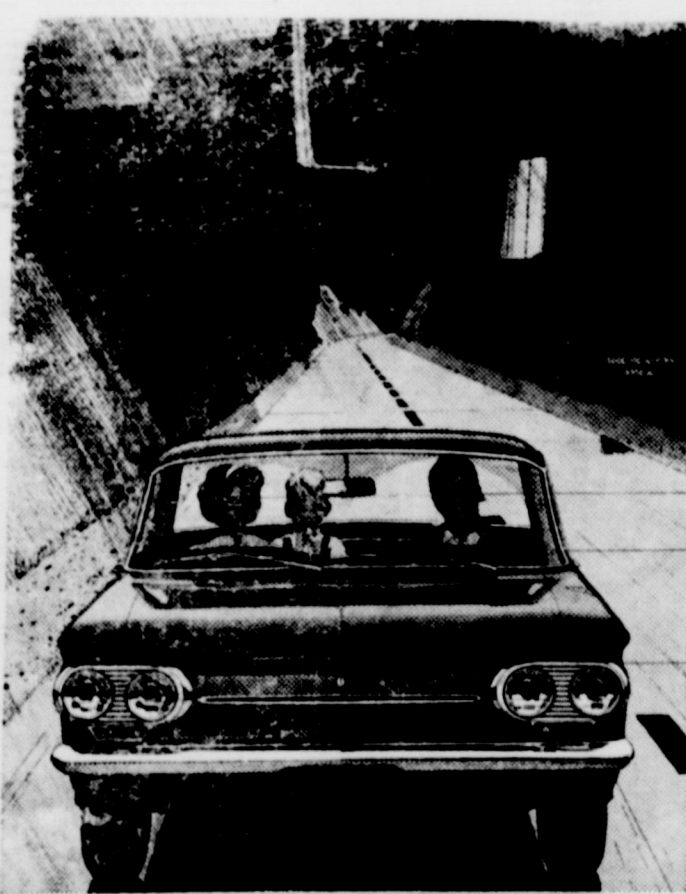
Monza Spyder Club Coupe