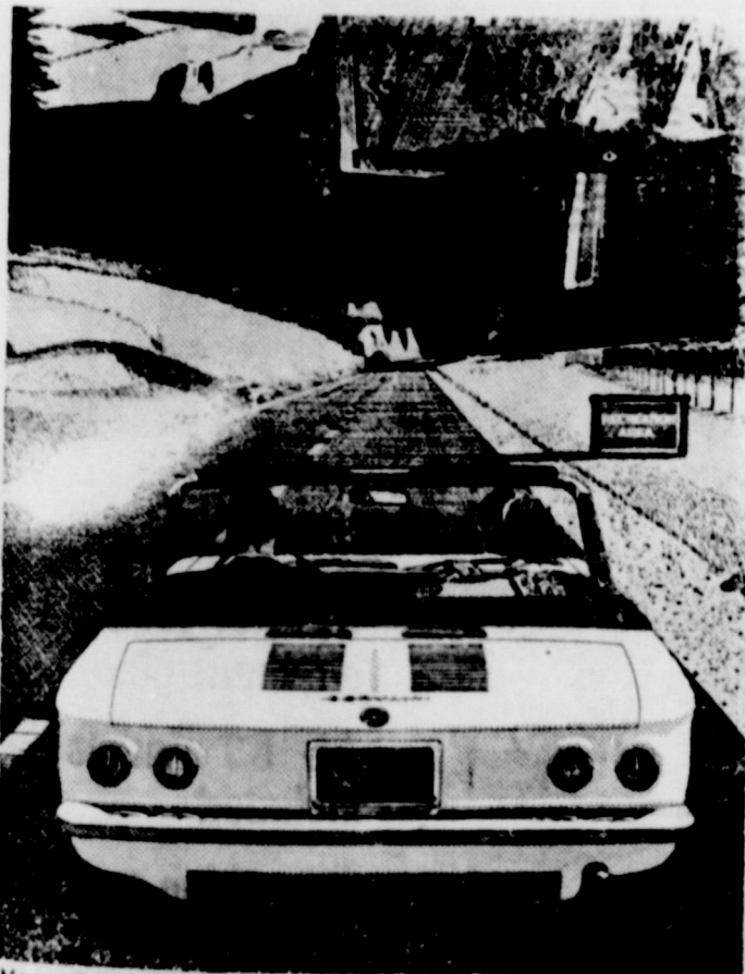
Monza Spyder Convertible