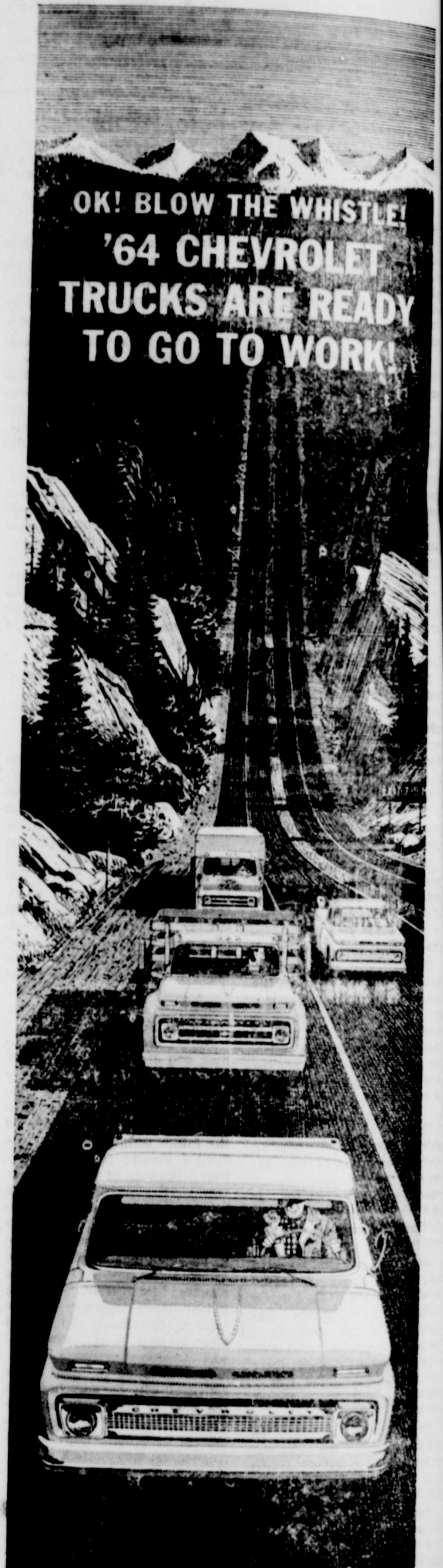
FRONT TO REAR: F1500 pickup, 60 Series stake, chassis cab with utility body, T10 60 cab model.