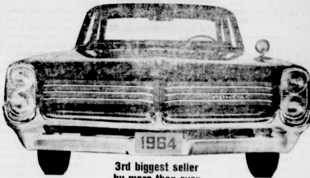
3rd biggest seller by more than ever

The important thing about being popular is staying that way. Wide-Track Pontiac