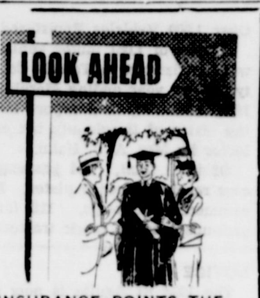
INSURANCE POINTS THE WAY TO COLLEGE . . .

Rising costs of a college education can be a real problem . but it's a problem that doesn't exist when you have the right insurance plan for your youngsters. See us.