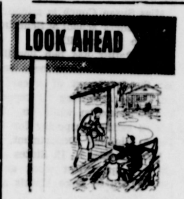
HELP IS IN SIGHT . . WHEN YOU'RE INSURED

No chance for flood and other natural disasters to wreck your pocketbook, when you have the proper insurance coverage Come in and consult with us No obligation, of course.