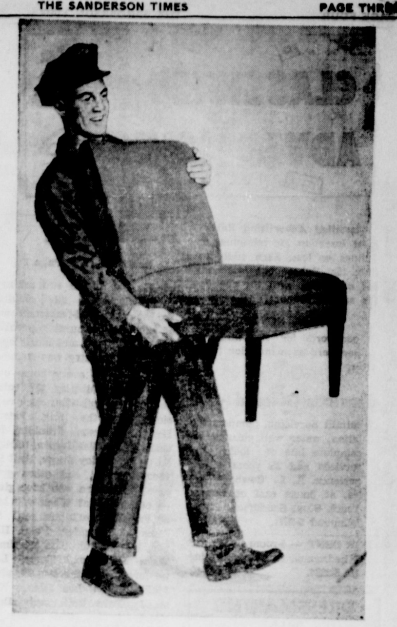
MOVING? THINK OF