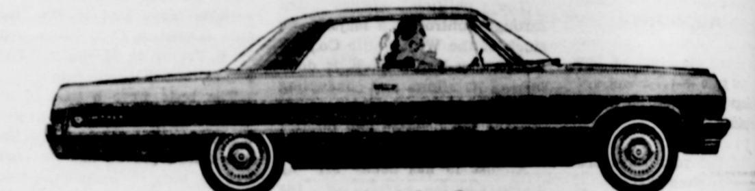
Chevrolet Impala Sport Coupe