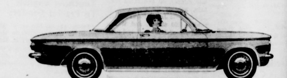
Corvair Monza Club Coupe

America's best sellers... Your best buys! Now at your Chevrolet Dealer's