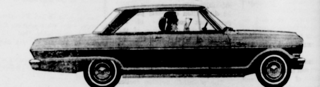
Chevy II Nova Sport Coupe