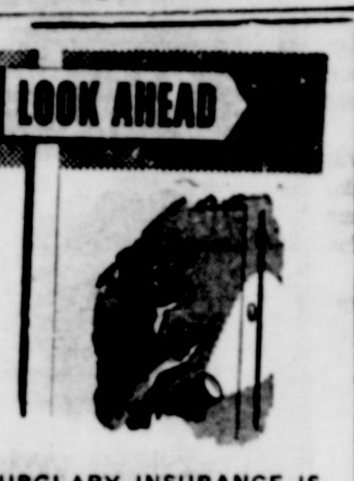
YOUR BEST WATCHMAN!

The cost of replacing your treasured possessions is probably a lot more than you think! The cost of burglary insurance is probably less than you think. Get the facts.