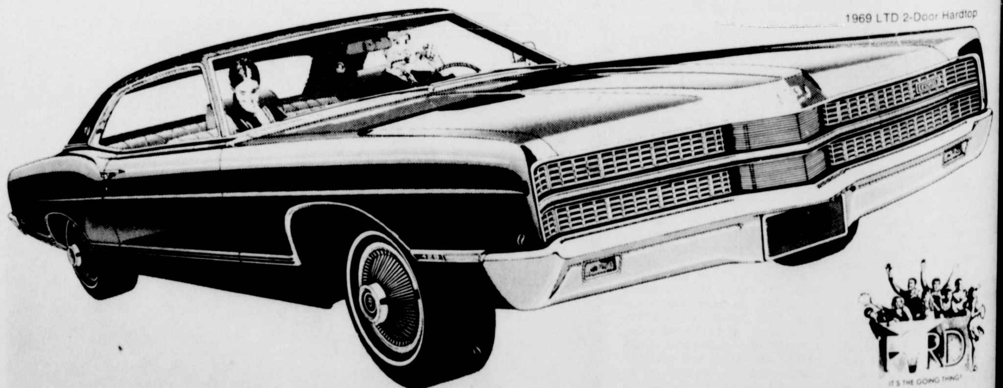
1969 LTD 2-Door Hardtop