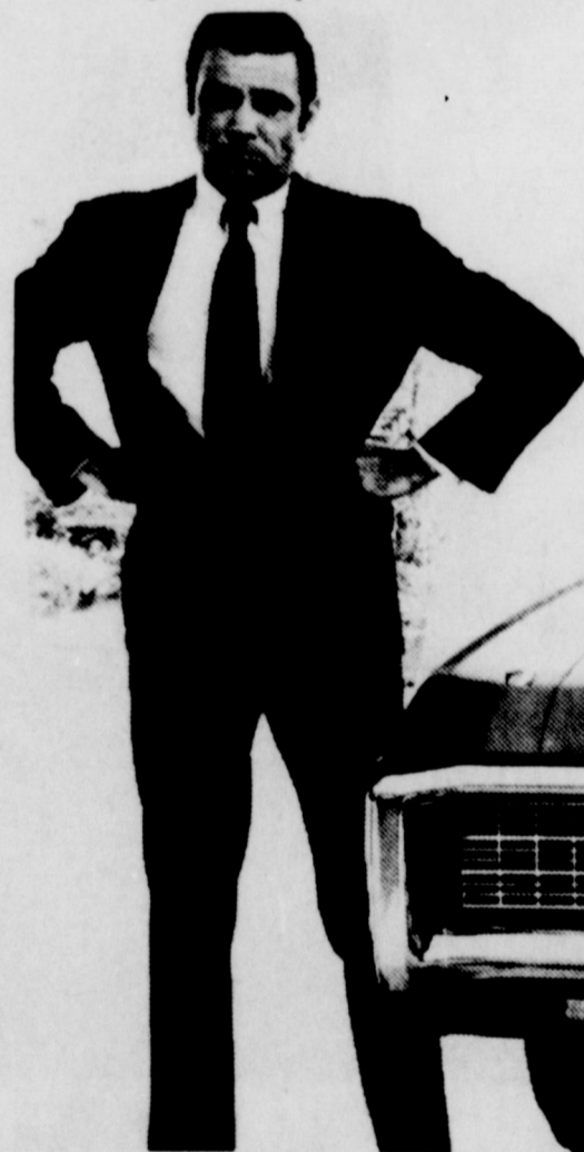
1969 Caprice Coupe