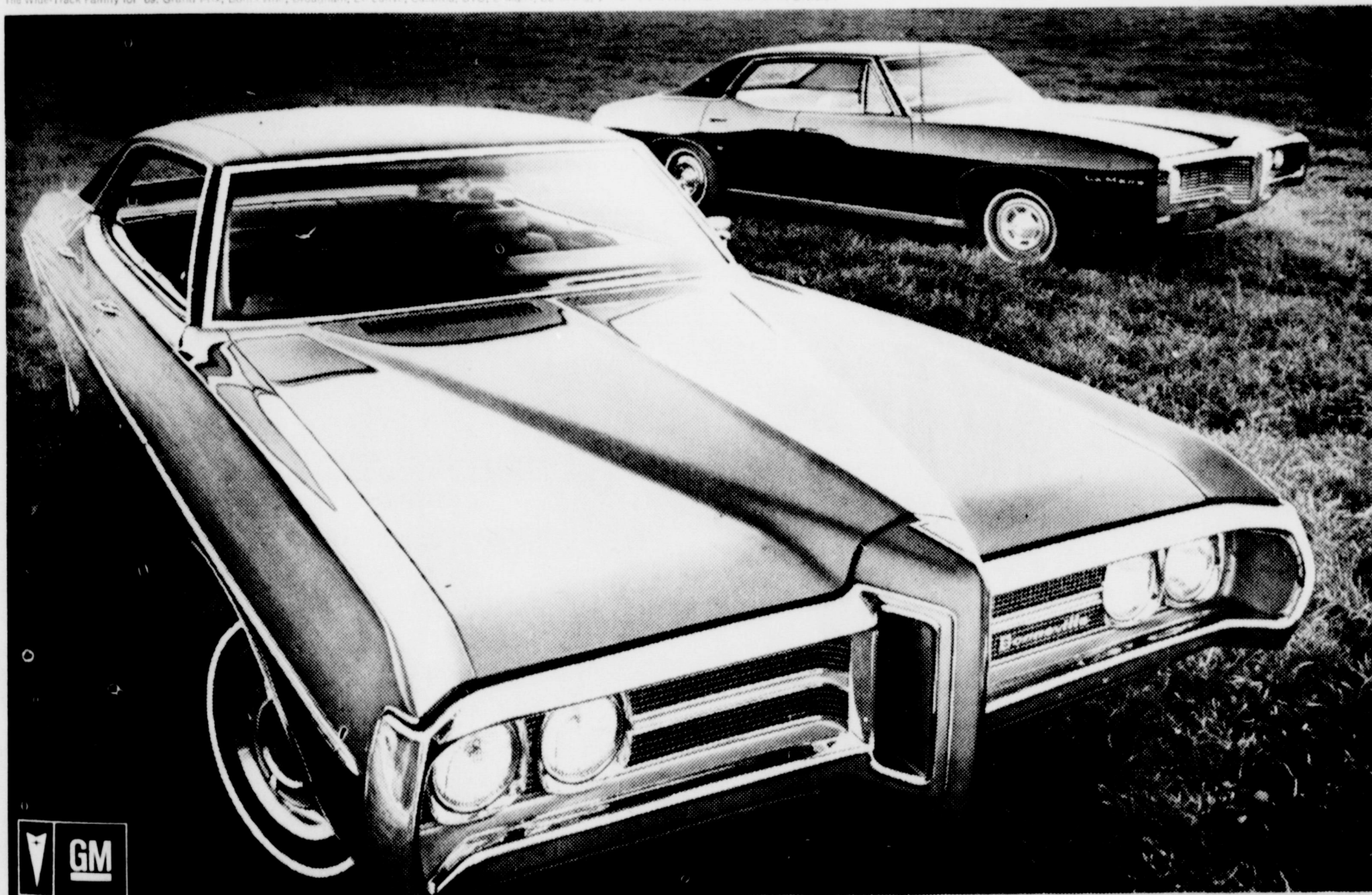
The Wide-Track Family for '69: Grand Prix, Bonneville, Brougham, Executive, Catalina, GTO, Le Mans, Custom S, Thirteen, Firebird, Formula, Motor Division