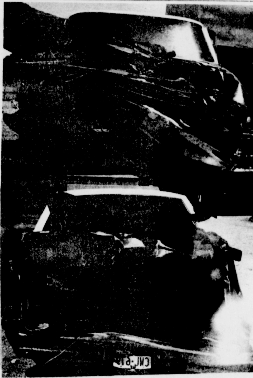
What happens to a car which straddles the guard rail of a bridge approach and rides the top of the bridge for several feet before falling off into the ditch on the rear of the car is shown in the pictures above. This 1966 Ford Galaxy was destroyed.

big lake! --- Have read other columns - continued to back page