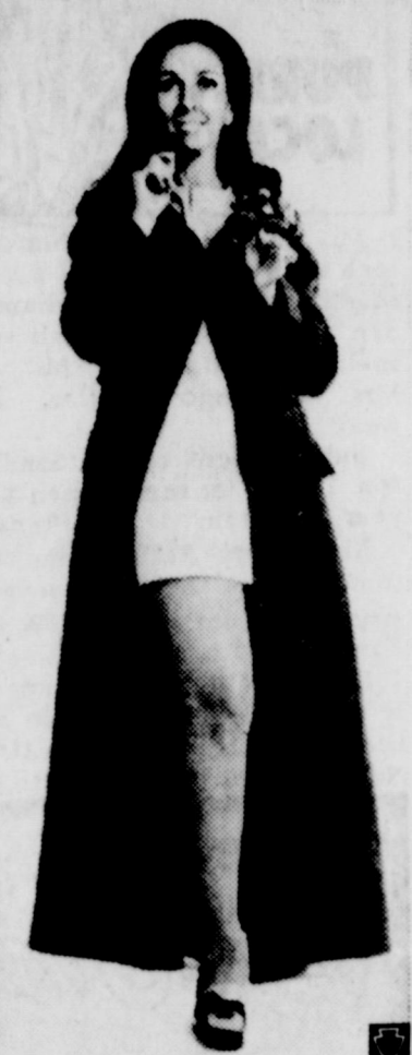
Mini, maxi, anywhere in between - no matter where the hemlines are this fall, pay attention to your waistline and you'll be able to wear them all. Your figure can look great in any style if you eat lots of fresh fruits instead of fattening desserts.