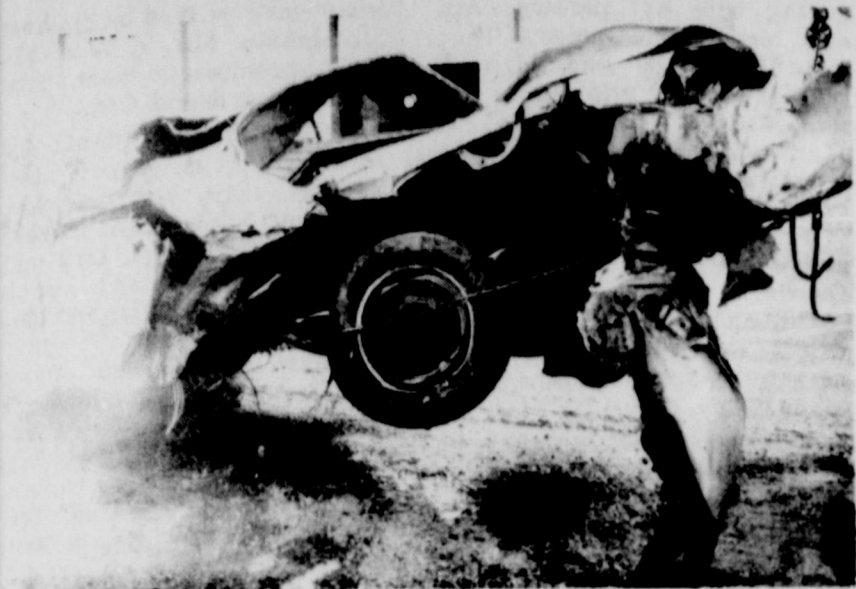
The family traveling in the car pictured above escaped serious injury when the vehicle was side-swiped on the bridge at Emerson, west of Sanderson, Friday morning of last week. A diesel transport truck met the automobile on the iced-over bridge and the car slid into the side of the truck, causing the damage shown in the picture. A son in the family of four was taken to Fort Stockton for examination for possible internal injuries after examination here by Dr. A. O. Clanton.