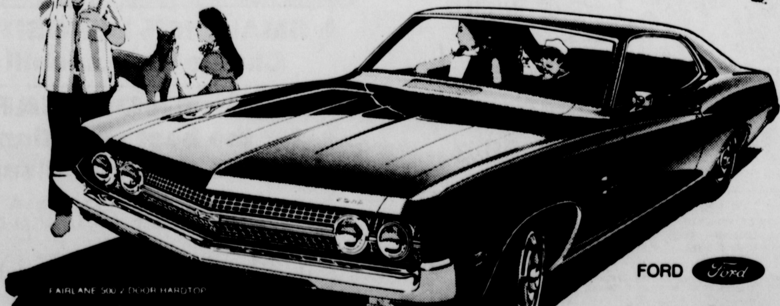
FAIRLANE 500 2 DOOR HARDTOP

For more information about these cars, see your Ford Dealer or write: Maverick Catalog, Dept. N-12 or Torino Catalog, Dept. N-13, P.O. Box 1503, Dearborn, Michigan 48121.