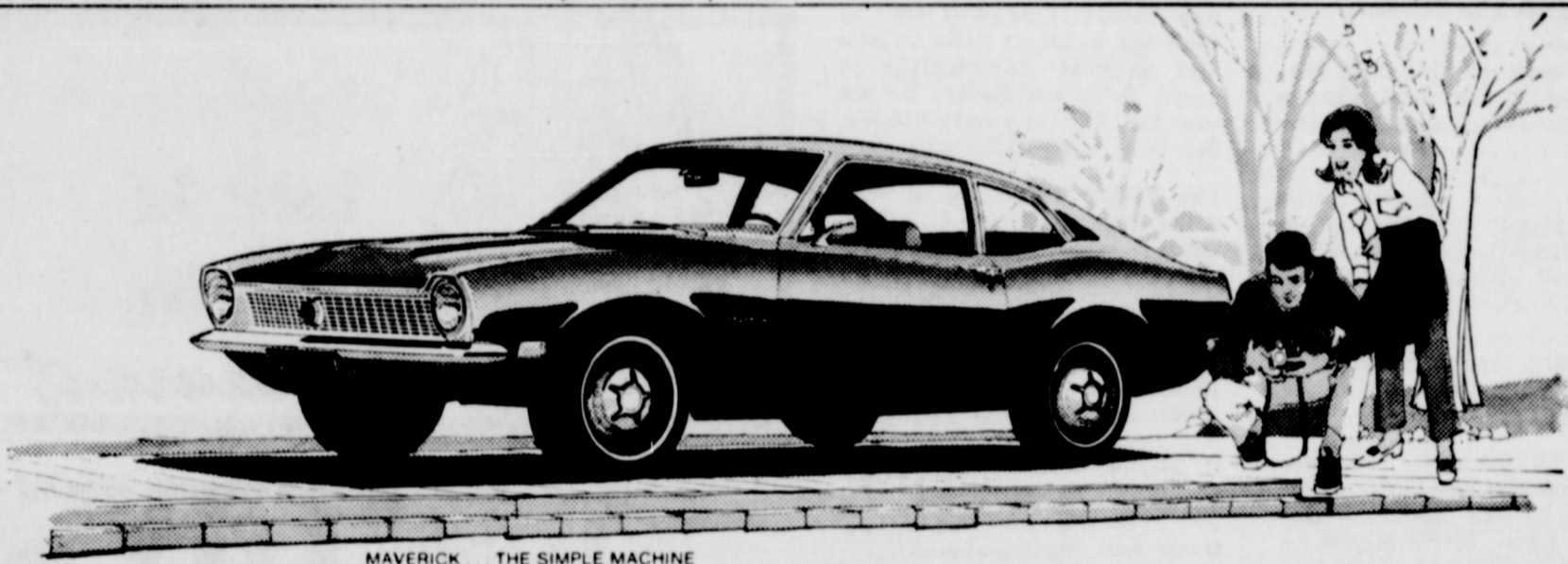
MAVERICK THE SIMPLE MACHINE

Maverick Still $1995.* The best small car value in the world.