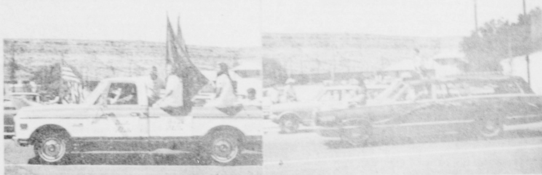
The color bearers at top left and at top right a group of horseback riders, Boy and Girl Scouts and Cadette Girl Scouts in the two lower pictures show a part of the parade that went down Oak St. just before noon Saturday. The parade was a part of the July 3 activities sponsored by the American Legion and Auxiliary and Sanderson Rodeo Club.