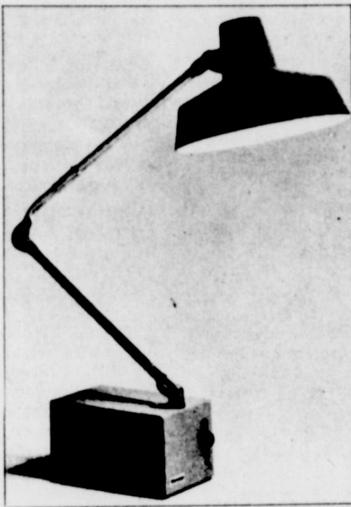
Designed specifically to light up wide areas with bright glare-free illumination. Wide-angle reflector is designed to spread light evenly over a large area. All metal construction. Folds to 4" x 4 1/4" x 11 1/2" for carrying or storage. Hi-Lo intensity switch. Articulating arm extends 15 inches. Keyhole slot for wall hanging. U.L. and C.S.A. approved.