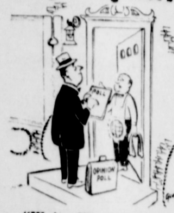
"Wait—I'll go ask her just what my opinion is—"