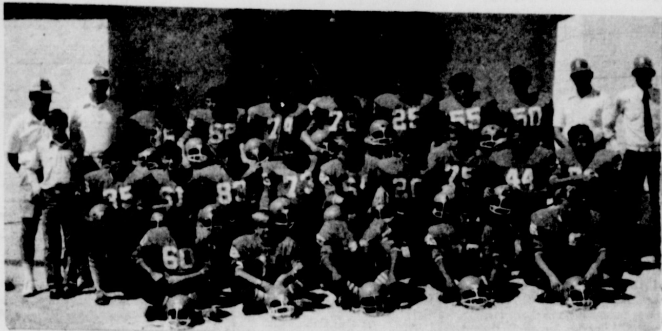
The Sanderson Eagles, their coaches, and managers are pictured above in front of the field house on Monday of this week. The Eagles were posed