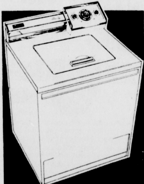
Model LWA 5540

3 cycles with special cool-down for Permanent Press fabrics