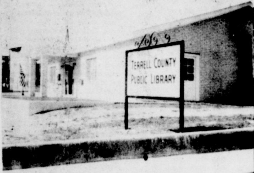
The sign purchased by the Friends of the Terrell County Public Library was installed by county employees last week, and adds to the appearance of the facility, while marking the location for visitors and newcomers to Sanderson.