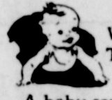
WELCOME To This World!

The cattle work pictures used in the last two issues of the paper would be incomplete without a picture of the chuck wagon scene. This one accompanies the pictures used previously on loan from F.G. Grigsby. Notice the efforts of some to find shade.