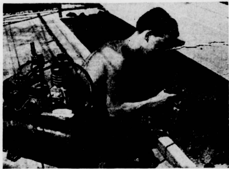
Chemically grown plants have few pest troubles, but spraying becomes necessary at certain times. That is why this convalescent airman is giving the spray treatment to the soilless-grown plants.