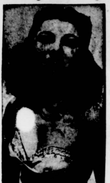
OH, MANN! — Peggy Mann is heard Sundays on the "RCA Victor Show" on NBC, singing popular tunes in support of Ken Delmar and the swing orchestra. Robert Merrill sings the classics.

NEW YORK.—Pert, pretty, petite Peggy Mann was a dancer as well as singer when she first started on her career. She ran to dance auditions and singing auditions with equal hopefulness and it was simply the fact that a singing audition came through first that pointed the way for her career.