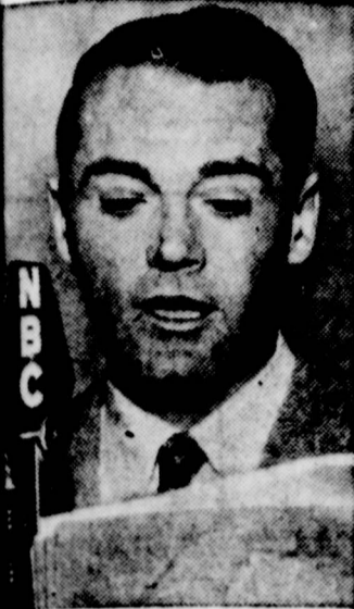
'OOTIN' TOOTIN' — Lanky, comic Henry Fonda of the films will play the lead in a rootin', tootin' western drama, "Frontier Marshal," on NBC's "Cavalcade of America" Monday, Mar. 31.