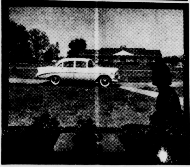
Visibility in today's auto design can be compared to picture windows of modern homes. In above view, Chevrolet's 241/2 sq. ft. glass approximates area in the window in which it is framed. Car visibility has been upped two-thirds in the last few years.