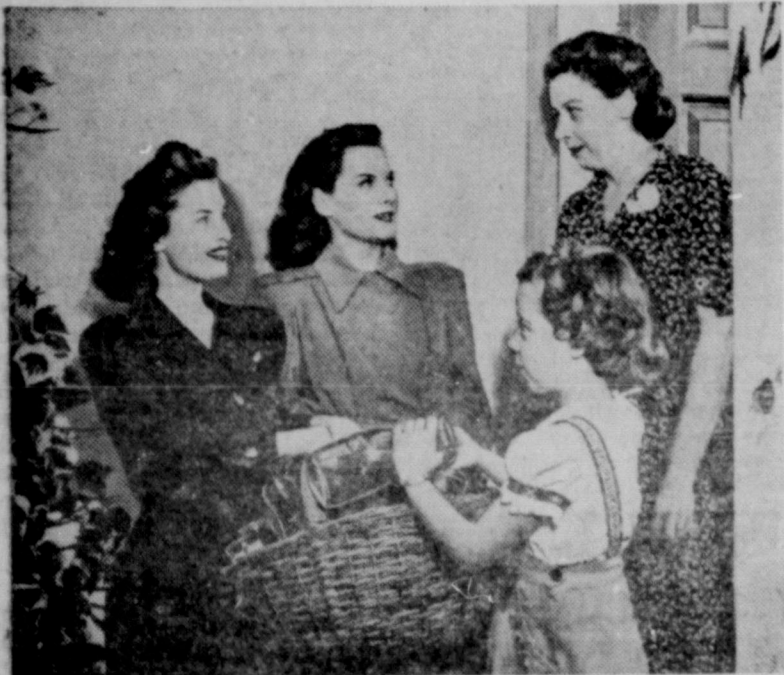
Many Texas housewives, like the movie actresses, collect empty milk, carbonated beverage and beer bottles from their neighbors and return them at least once a week to the point of purchase.