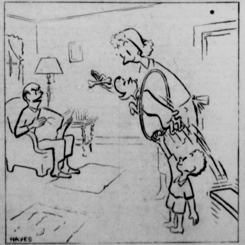
"Why can't he just eat, like other dogs?"