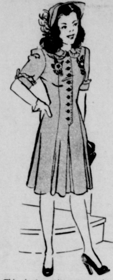
This junior miss wears a between-seasons creation of spun flannel with hand-applied flowers and self-ruffles on the Peter Pan collar and cuffs.