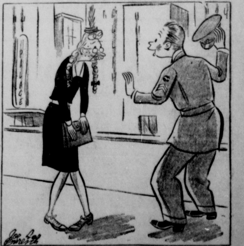
"It can't be Madge... that freckle-faced, knock-kneed, skinny little kid whose pigtails I used to pull!"