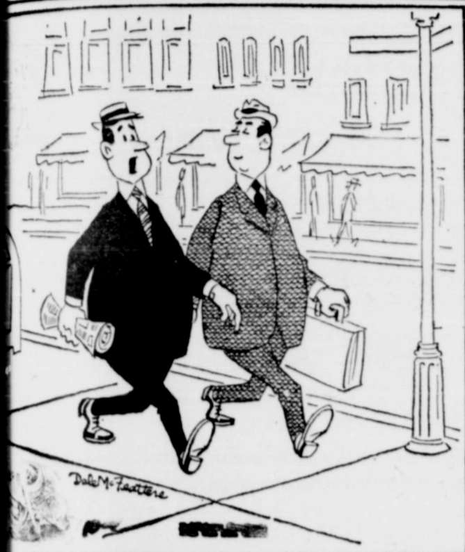
“Yes, I have a steady income — but my wife has a steadier outgo!”