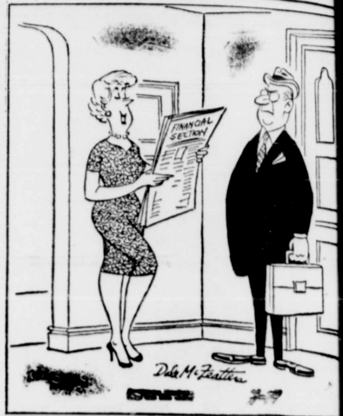
"I see that the man who complains about my household budget reports his company lost two million dollars."

The Rankin (Tex) News— Thursday, Sept. 20