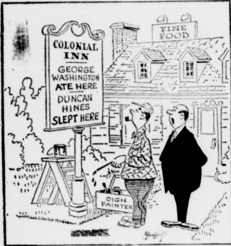
"Somehow it doesn't look just right!"