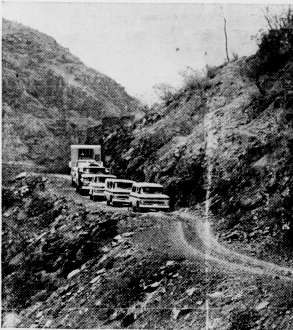
Sometimes the caravan crept along for hours in low gear. It took 17 days to go 1,066 miles! This is the road near Loreto.

See the "New Reliables" now at your Chevrolet dealer's!