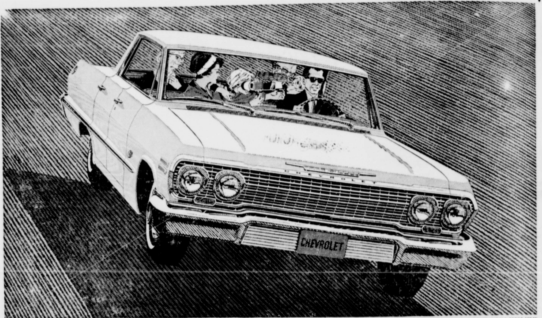
'63 CHEVROLET IMPALA SPORT SEDAN

The demonstration on (Continued to Next Page)