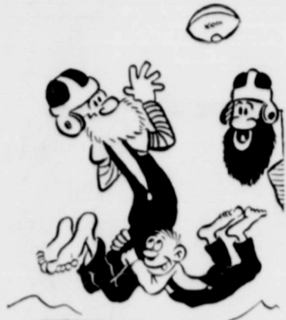
THE KIDS LET GRANPAW PLAY CAUSE WE GOT A POLICY WITH