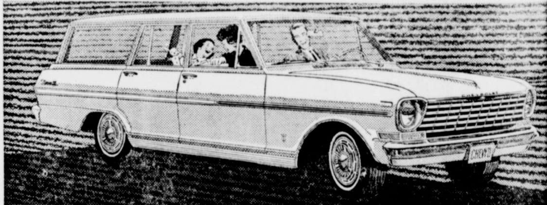
'63 CHEVY II NOVA 400 STATION WAGON—Gives modest budgets lots to brag about.