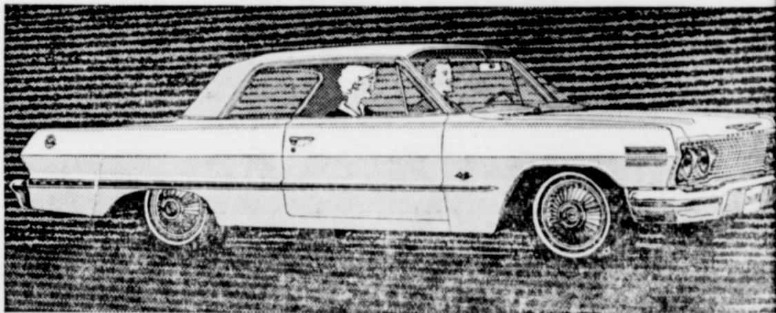
'63 CHEVROLET IMPALA SPORT COUPE—Looks expensive? Look twice at the price.

at extra cost) that makes the sporty Corvaire Monza second only to the all- new, all-out Corvette Sting Ray for exciting going. With four entirely differ- ent kinds of new cars like these to choose from, you can see why just picking your '63 Chevrolet is a ball by itself!