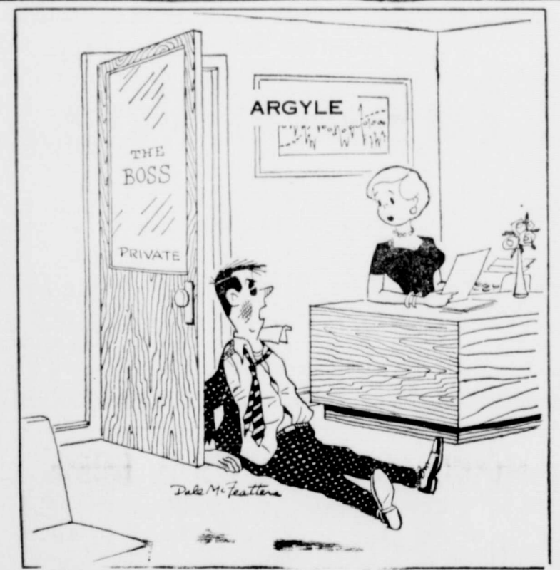
"You and your 'His bark is worse than his bite!"