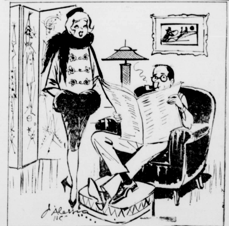
"I'm going shopping, dear. I simply have got to do SOMETHING to take my mind off our money troubles!"

LOWERY AND Phone MY 3-2402 2 for T THIS FINE SUIT TH' ED ME INSURED WITH 2 boxes