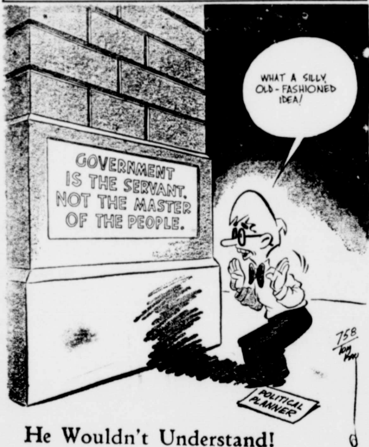
He Wouldn't Understand!