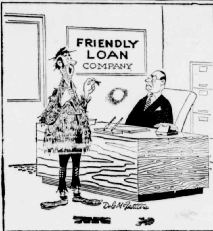
"Greetings from a friend!"