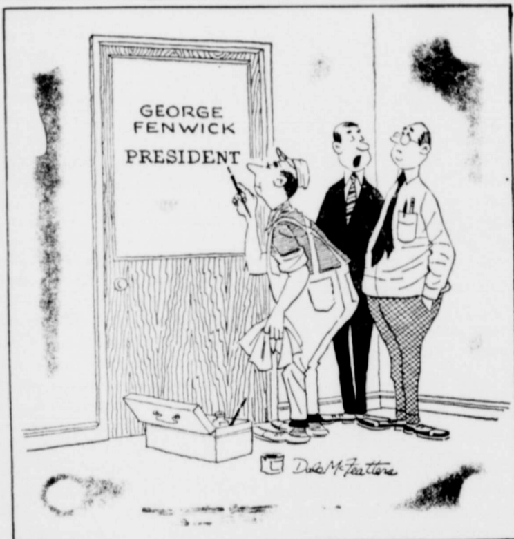
"Remember how for years our favorite expression was 'Let George do it!'"