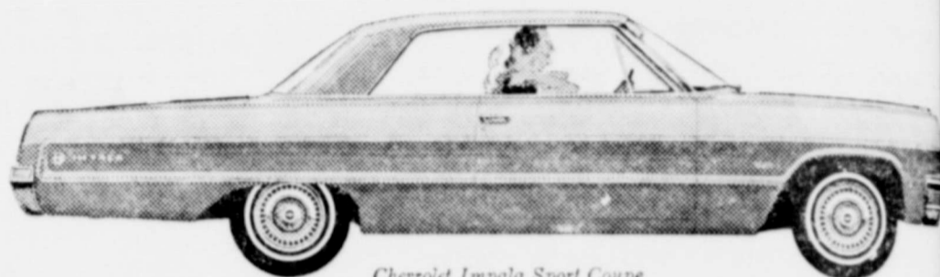
Chevrolet Impala Sport Coupe

It is reported that on Friday, the Roundup has received 99 sheep, 23 horses and six head of