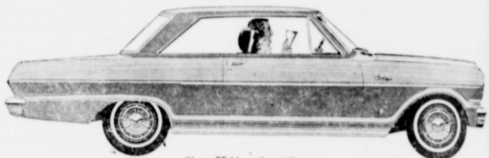
Chevy II Nova Sport Coupe