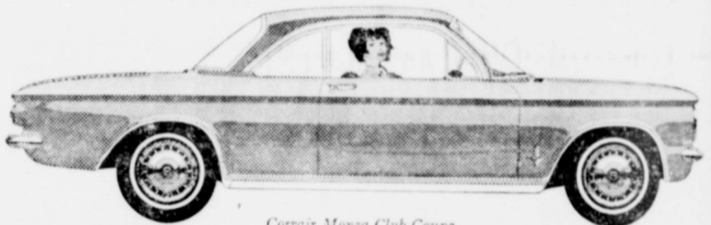
Corvair Monza Club Coupe

America's best sellers... Your best buys! Now at your Chevrolet Dealer