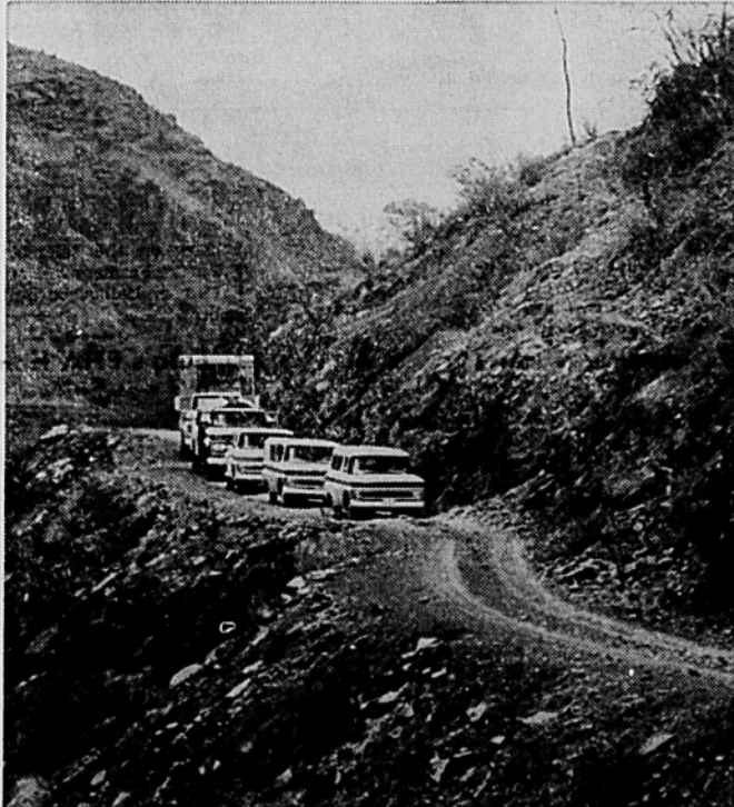
Sometimes the caravan crept along for hours in low gear. It took 17 days to go 1,066 miles! This is the road near Loreto.

...THE ONES THAT WHIPPED THE BAJA RUN...TOUGHEST UNDER THE SUN... TO SHOW THE WORTH OF NEW ENGINES, FRAMES AND SUSPENSIONS!