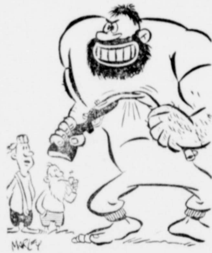
ALL BABOON MELLOON'S FREN'S IS PERFECTED BY HIS POLICY WITH