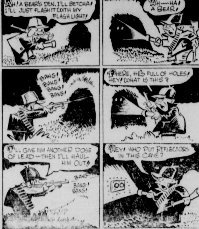
'The Voice' of Japan