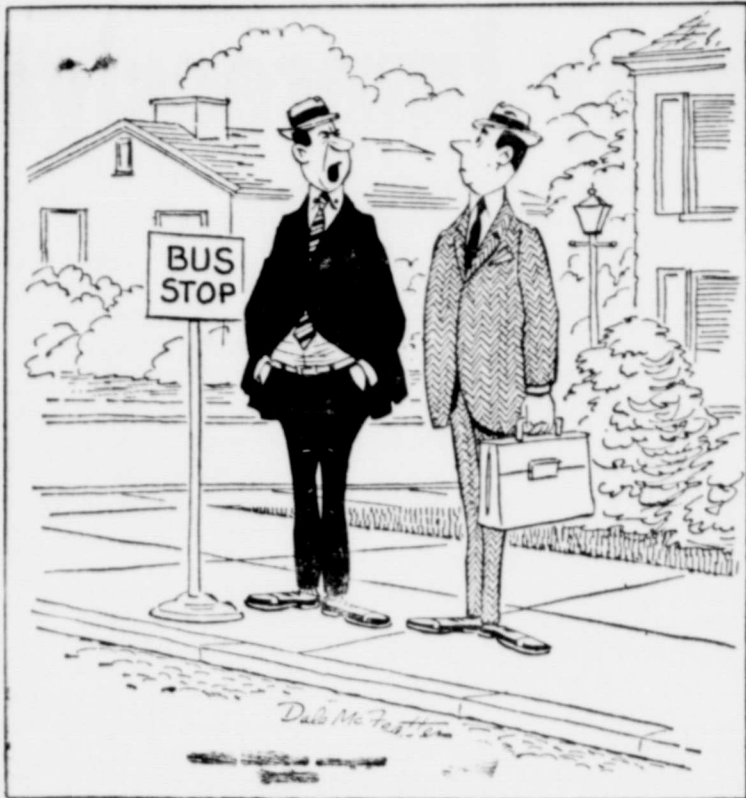
"This getting up in the morning and going to work spoils my whole day!"