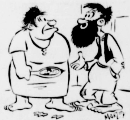
MIRRORS ALWAYS BUST WHEN YOU LOOK AT 'EM SHOULD'VE GOT IT INSURED WITH

FOR SALE: 6500 BTU window cooler used less than 10 hours. Come and get it this week at $100. See at 503 S. Elizabeth or call 693.2858.