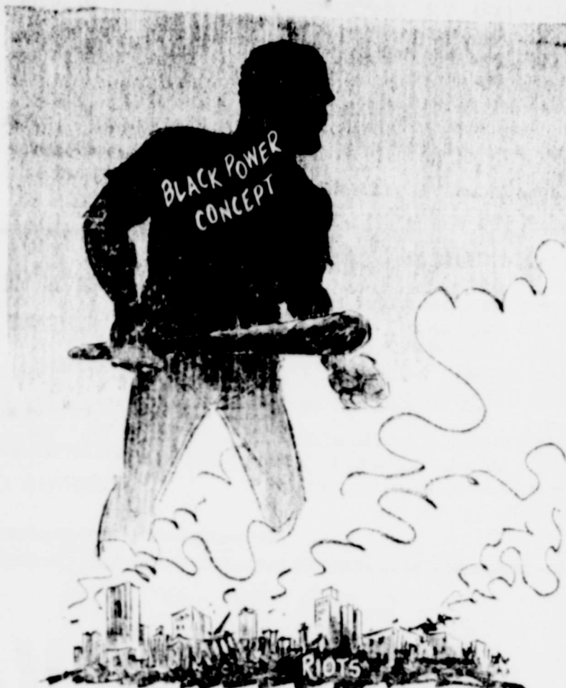
DOCTRINE OF DISCONTENT

day of the common laborer be- ing able to provide for himself— much less a large family—is a bout a thing of the past. Pick up any large Sunday newspaper and you find pages of ads pleading for workmen and not all are re- quired to have a college degree but almost without exception, the jobs do call for some basic trade skills—the very thing most of the people in the so-called "ghet- ttos" lack.