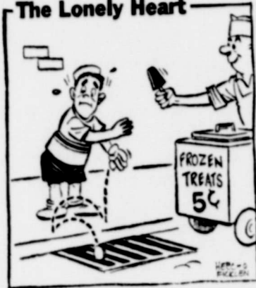
The Lonely Heart

We're told that the very existence of the Nation is threatened, but here again, I don't see how. This Nation is not made up of a Congress and President. It is (Continued to Next Page)