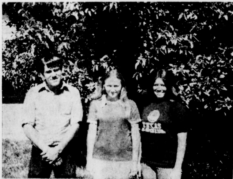
BANDSMEN OF THE WEEK

With selections made at 1 p.m. each Tuesday, those who have