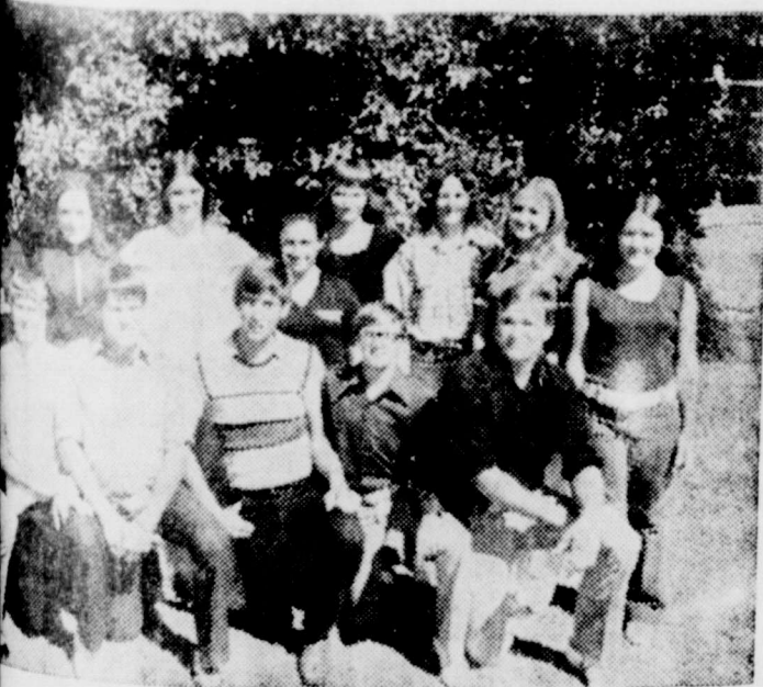
PREVIOUS AWARD WINNERS