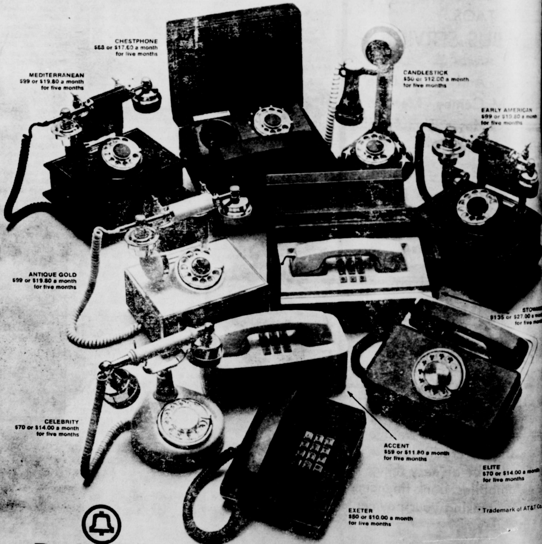
CHESTPHONE $58 or $17.60 a month for five months

months without interest. To assure quality phone service, the working parts (dial, cords and electrical components) remain our property and responsibility. So anytime these parts need repair, we'll fix them without additional charge. To order or for more information, call your Southwestern Bell business office.