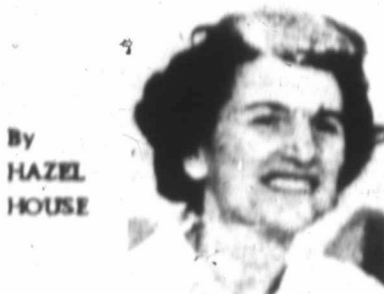
By HAZEL HOUSE

Scripture: Philippians 4:5-8, 19; II Timothy 2:3-4; Hebrews 13:5-9; Romans 12:2.