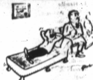
"You mean I can blame it all on my parents?"