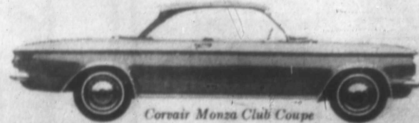
Chevrolet Monza Club Coupe

Traditionally, Chevrolet has been America's best seller. And right now, more than ever, because the '64 model year is almost over and your Chevrolet dealer has to make room for the '65s, U.S. America's best buy. But don't wait.