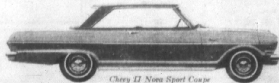
Chevrolet Nova Sport Coupe