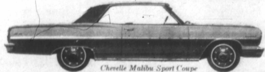
Chevrolet Malibu Sport Coupe