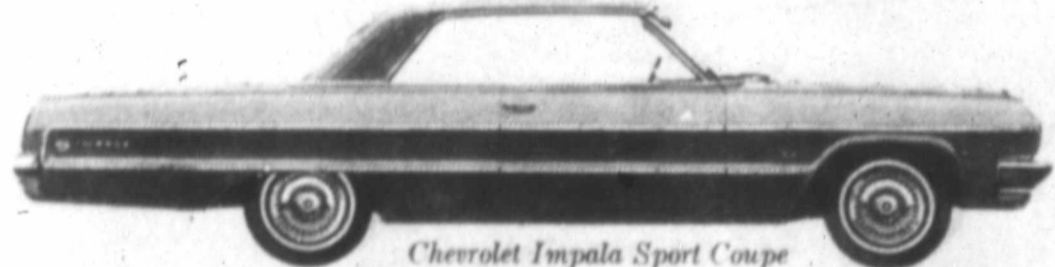
Chevrolet Impala Sport Coupe

The perfect time to get the best deal on America's No. 1 cars