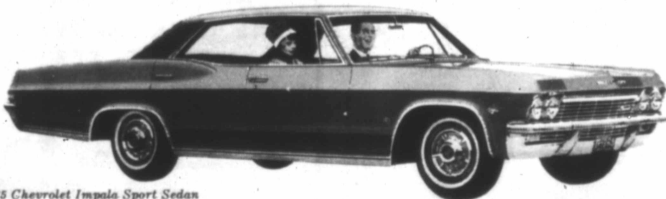
'65 Chevrolet Impala Sport Sedan