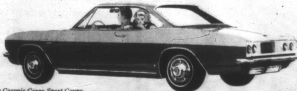
New Corvair Corsa Sport Coupe

It's '65's biggest, most beautiful change. There's striking new styling. New length, width and lowness. A roomier new Body by Fisher housing an interior that's a knockout. And a more serene Jet-smooth ride with a new Full Coil suspension system. Fact is, if you overlook just one thing you can easily convince yourself you're onto a big expensive car here. And that thing is its Chevrolet price.