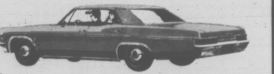
Impala Sport Sedan.