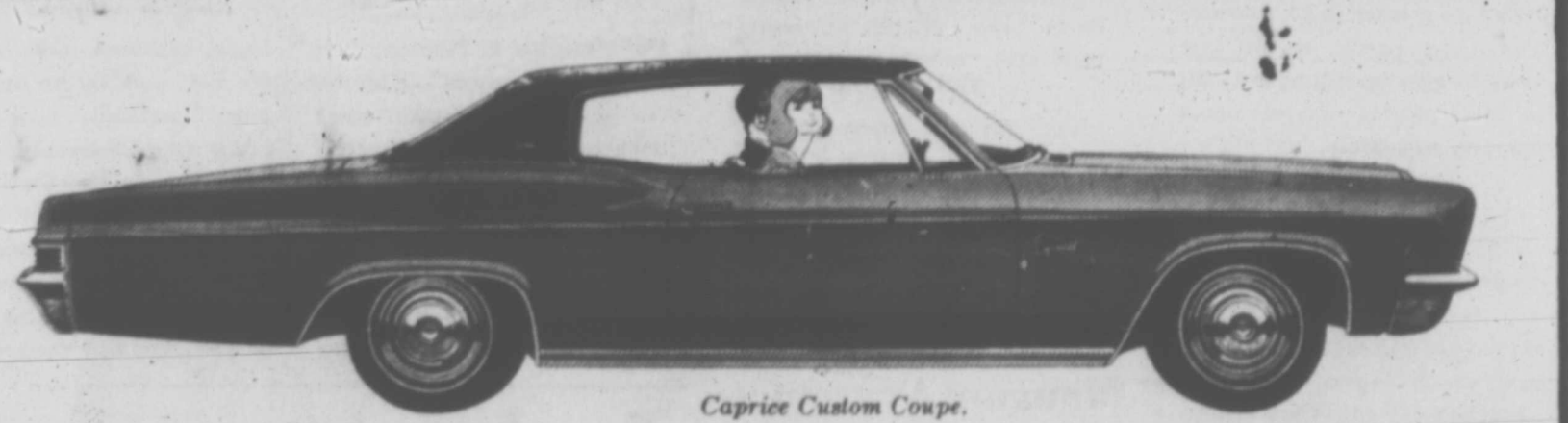
Caprice Custom Coupe.