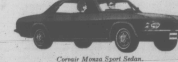
Corvair Monza Sport Sedan.