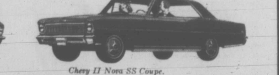
Chevy II Nova SS Coupe.