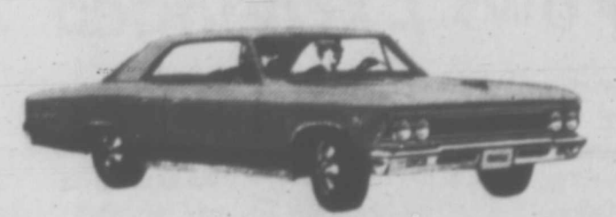
Chevelle SS 396.