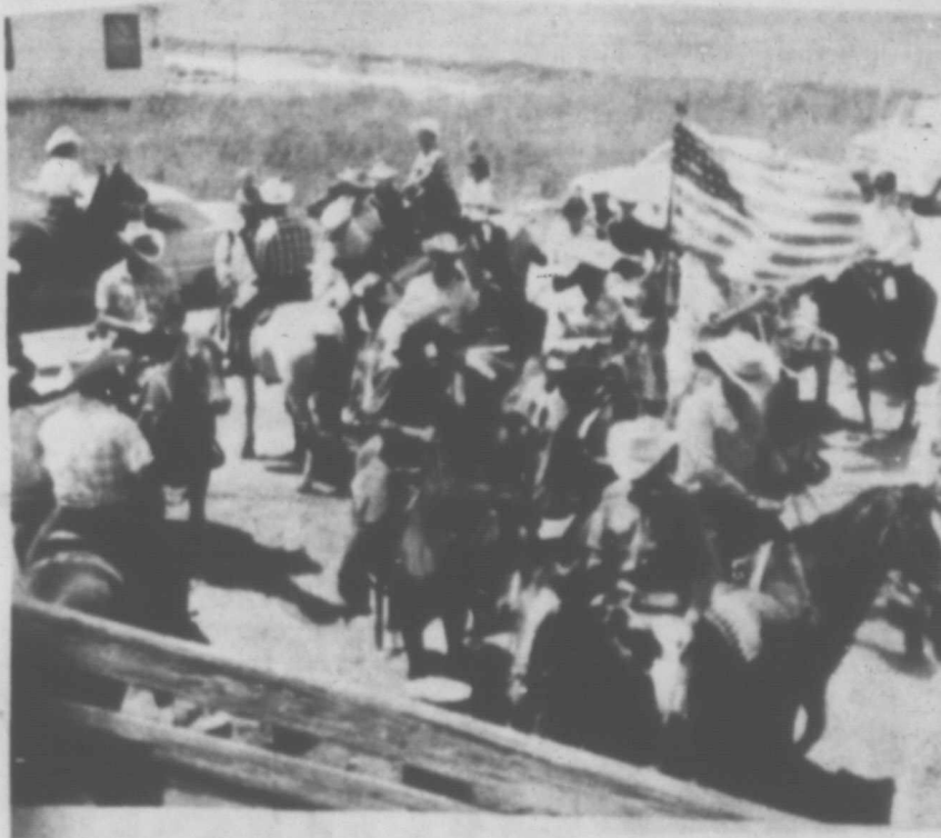
RING AROUND THE FLAG - Shown above is the commotion that preceded the Grand Entry of the Little Britches Rodeo.